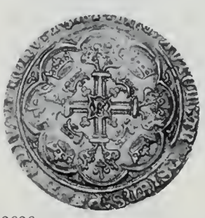
Lot No. 2828